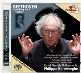
PTC 5186 317