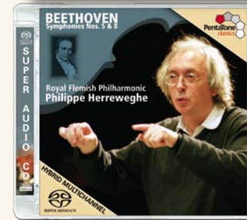
PTC 5186 316