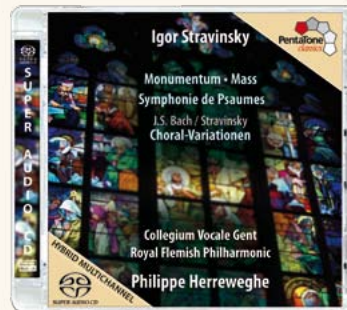
PTC 5186 349