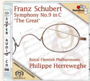
PTC 5186 372

The European musical press acknowledged Philippe Herreweghe's artistic vision by proclaiming him Musical Personality of the Year in 1990. In 1993, Philippe Herreweghe and the Collegium Vocale Gent were appointed Cultural Ambassadors in Flanders. A year later he was awarded the Order of the Officier des Arts et Lettres and in 1997, Philippe Herreweghe received an honorary doctorate from Louvain University. In 2003, he was made a Chevalier de la Légion d'Honneur in France.