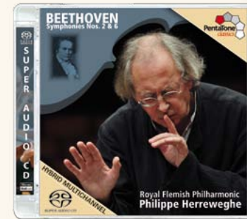
PTC 5186 314